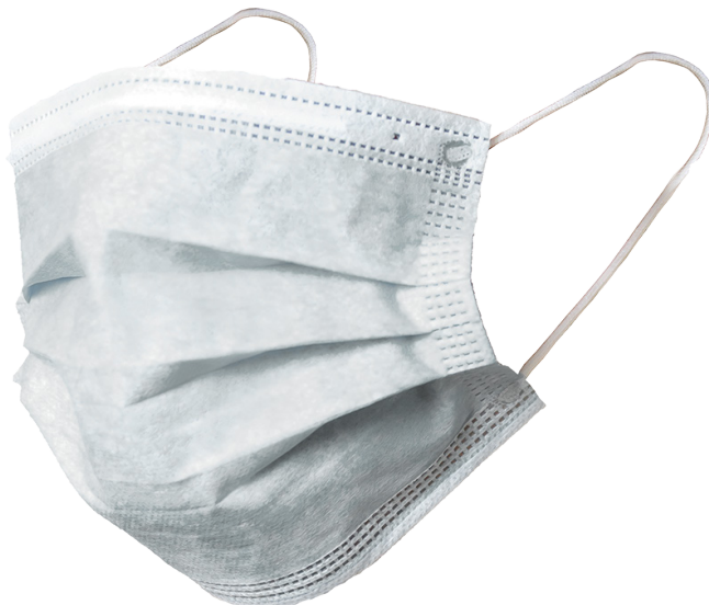
Actual product may vary